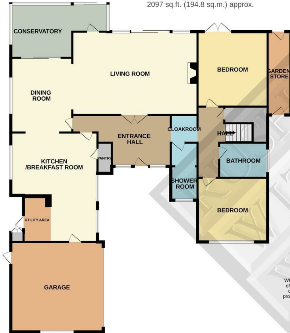
GROUND FLOOR 2097 sq.ft. (194.8 sq.m.) approx.